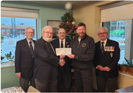
The Ottawa Chapter of the Royal Canadian Electrical and Mechanical Engineers Guild.