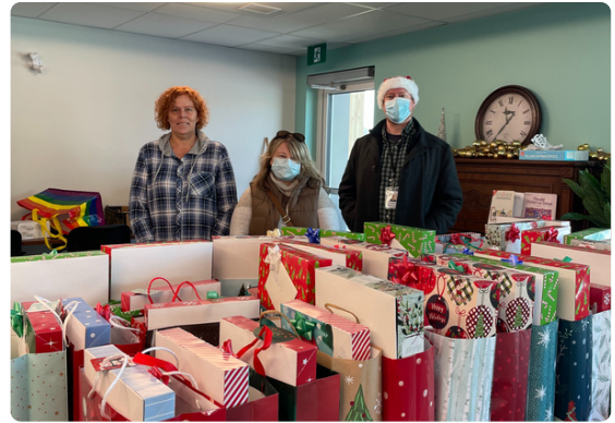
Members of the Christmas Community Outreach - VAC National Capital area presenting Christmas gifts at ACB.